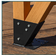
Reinforced steel frame footings