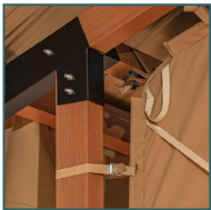
Etched aluminum framework and steel connectors