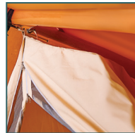
Dual layers create insulating air-gap