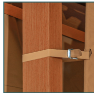
Fully adjustable anti-slip buckles