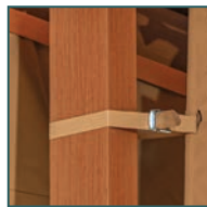
Fully adjustable anti-slip buckles