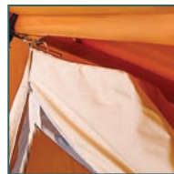
Dual layers create insulating air-gap