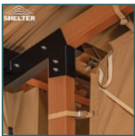
Strong aluminum and steel frame