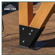
Reinforced steel frame footings