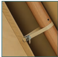
Fully adjustable anti-slip buckles