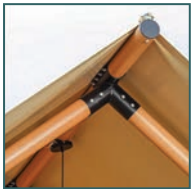
Strong aluminum and steel frame