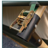
Ratchet strap tensioners